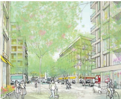
06 The Central Spine