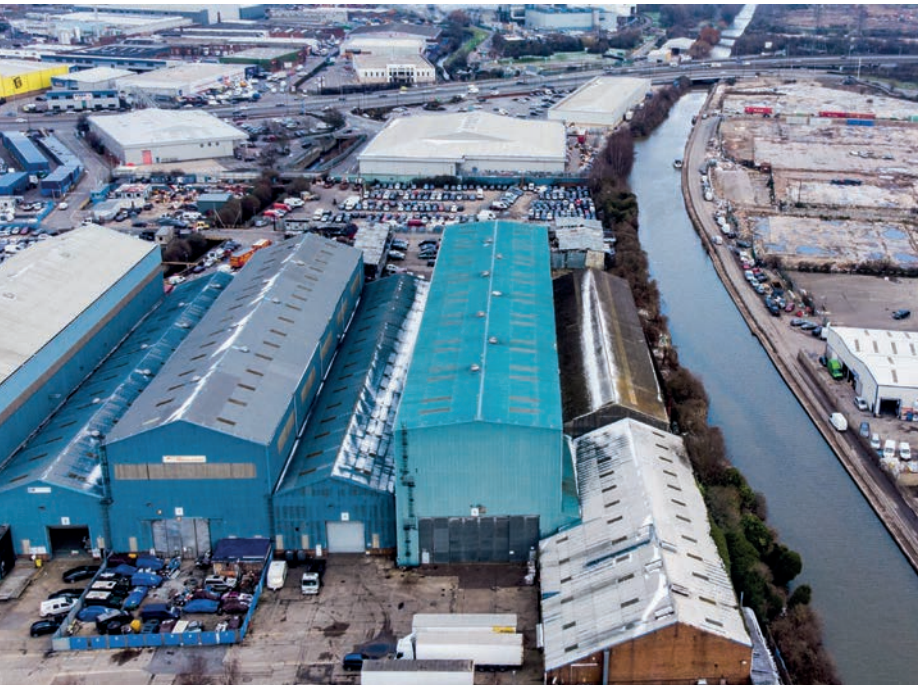
The Former Gasworks, Upper Edmonton 1923▲

The Lea Valley Navigation Channel, although currently publicly accessible, is largely forgotten and underutilised in contrast to the surrounding lush greenery of the Lee Valley Regional Park. Bound by the North Circular and the Railway Line, the intricate network of waterways are concealed, underused and culverted in places.