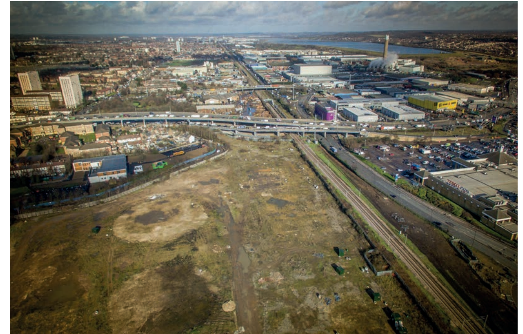
Angel Road, Culverting Pymmes Brook, 1921▲