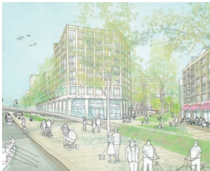
05 The Towpath