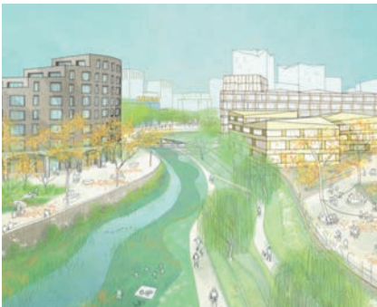
03 Brooks Park