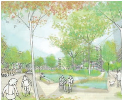
04 The Greenway