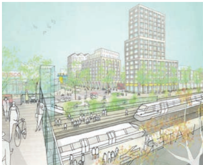
01 Meridian Water Station

Meridian Water plants the seeds for a new green community through a patchwork of thoughtfully designed and socially driven green public realm.