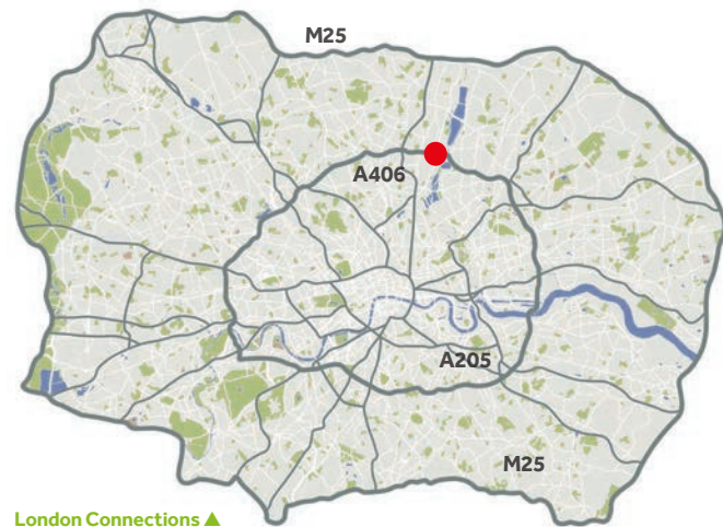
London Connections ▲

Meridian Water is one of London's largest regeneration opportunities. Located between Edmonton, Tottenham and Walthamstow, it is ideally placed to deliver the spatial, sustainable growth and economic resilience objectives of the London Borough of Enfield.