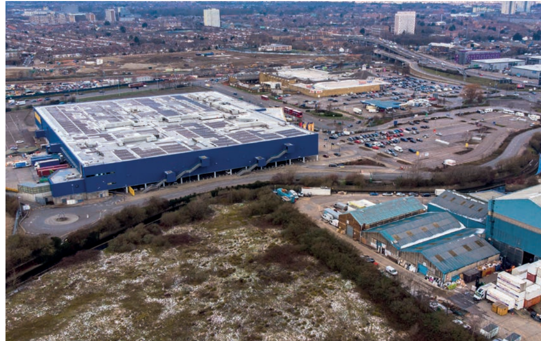
The Lea Towpath, PE Lock 1950▲