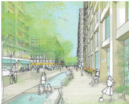
02 Meridian Mews