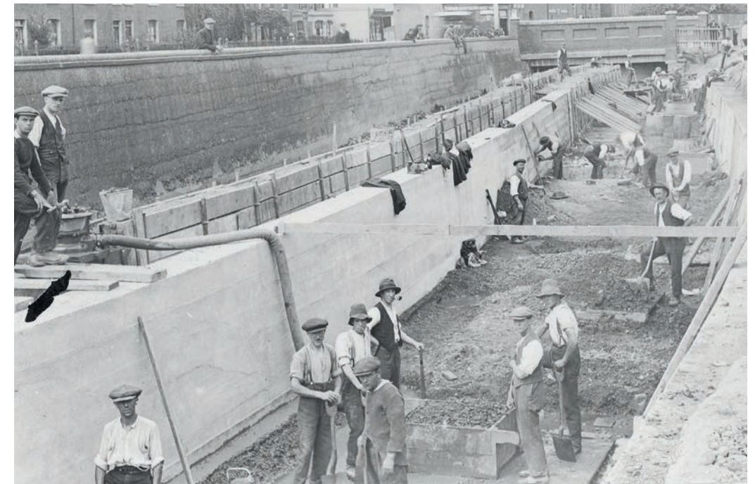
Angel Road, Culverting Pymmes Brook, 1921▲