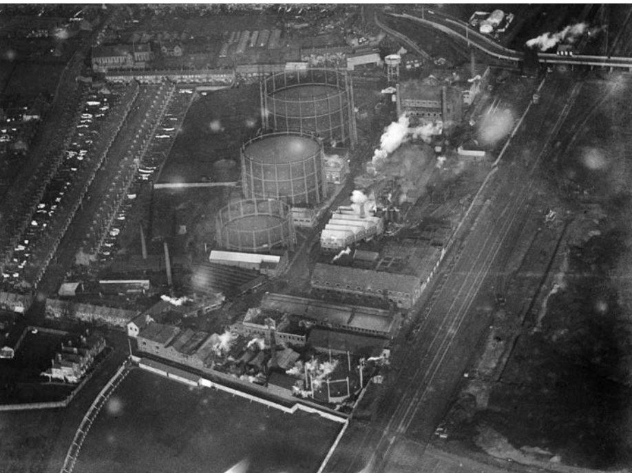
The Former Gasworks, Upper Edmonton 1923▲

Enfield has always been attractive due to it's transport links and ample space. The borough played a major role in the industrial expansion of the late 19th century Lea Valley, contributing a great number of local inventions from the halogen cooker to digital telephone equipment.